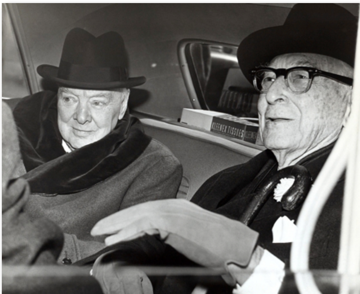
[Image] Winston Churchill and Bernard Baruch , financier, converse in the back seat of a car in front of Baruch's home.

Behind the secret of the atom sits enthroned one of the most mysterious and powerful personalities of world Jewry in the person of Bernard Baruch, “ the philanthropist ” banker who, in the most obscure circumstances amassed a personal fortune during the two world wars. In the imagination of the American people, perhaps not without reason, Bernard Baruch appears as the “ unofficial President of the U.S. ” and even Churchill has to visit Baruch first, before he calls at Washington to see the official President of the US. When Roosevelt became President, Baruch’s power and influence was multiplied.