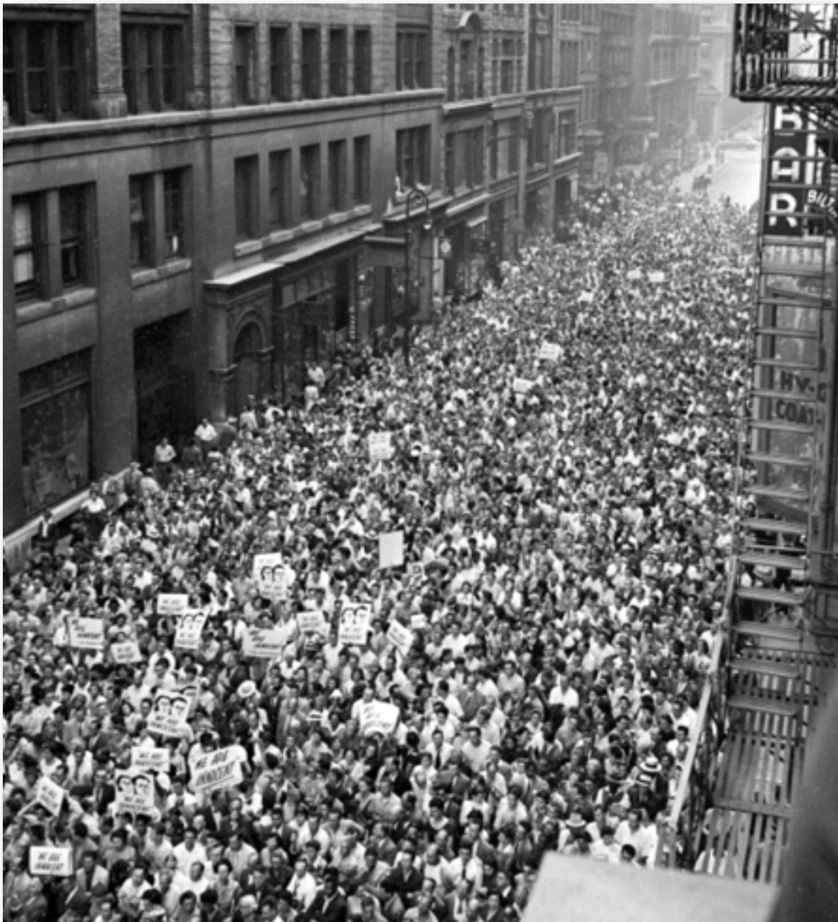
[Image] Julius and Ethel Rosenberg sympathizers protesting in E. 17th St., New York.

On Union Square in New York, the Irish policemen were hardly able to cope with the situation brought about by fainting fanatical Jewesses collapsing when they heard that their adopted country, the United States, had executed the traitors according to the sentence of the Court.