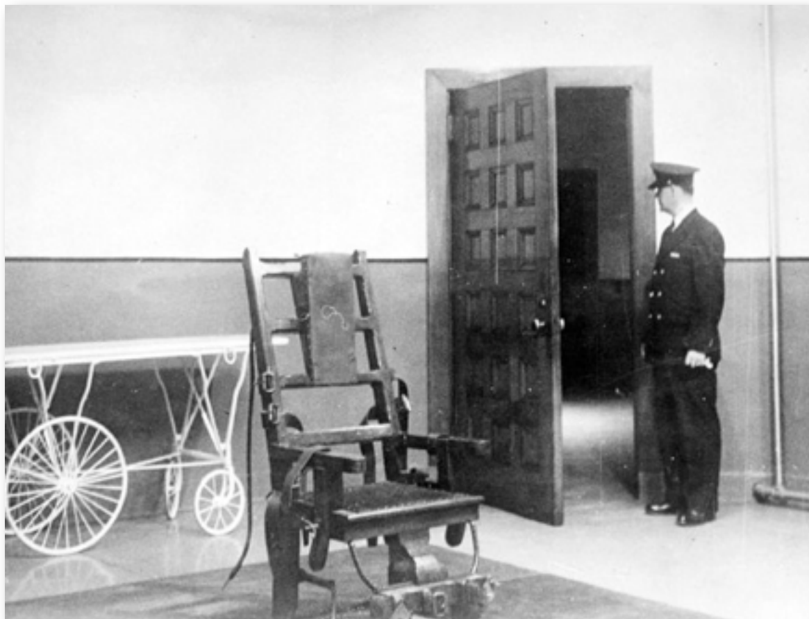
[Image] The Electric Chair room at Sing Sing Prison, New York where the Rosenberg couple were executed for treason.

From now on, President Eisenhower, the latest successor of Washington and one of the executors of the Morgenthau Plan , could count on the fact that his name, too, would be on the blacklist of “ war criminals ” and “ enemies of the people ”. The gallows of Nuremberg were now facing towards the White House and casting their shadows on it. Supranational “ Nazism ” has declared war upon America and upon its faithful servant President Eisenhower. Possibly not only the voice of Emanuel Bloch was to be heard over the coffins of the Rosenbergs, but the echo also of Julius Streicher’s words from Nuremberg: