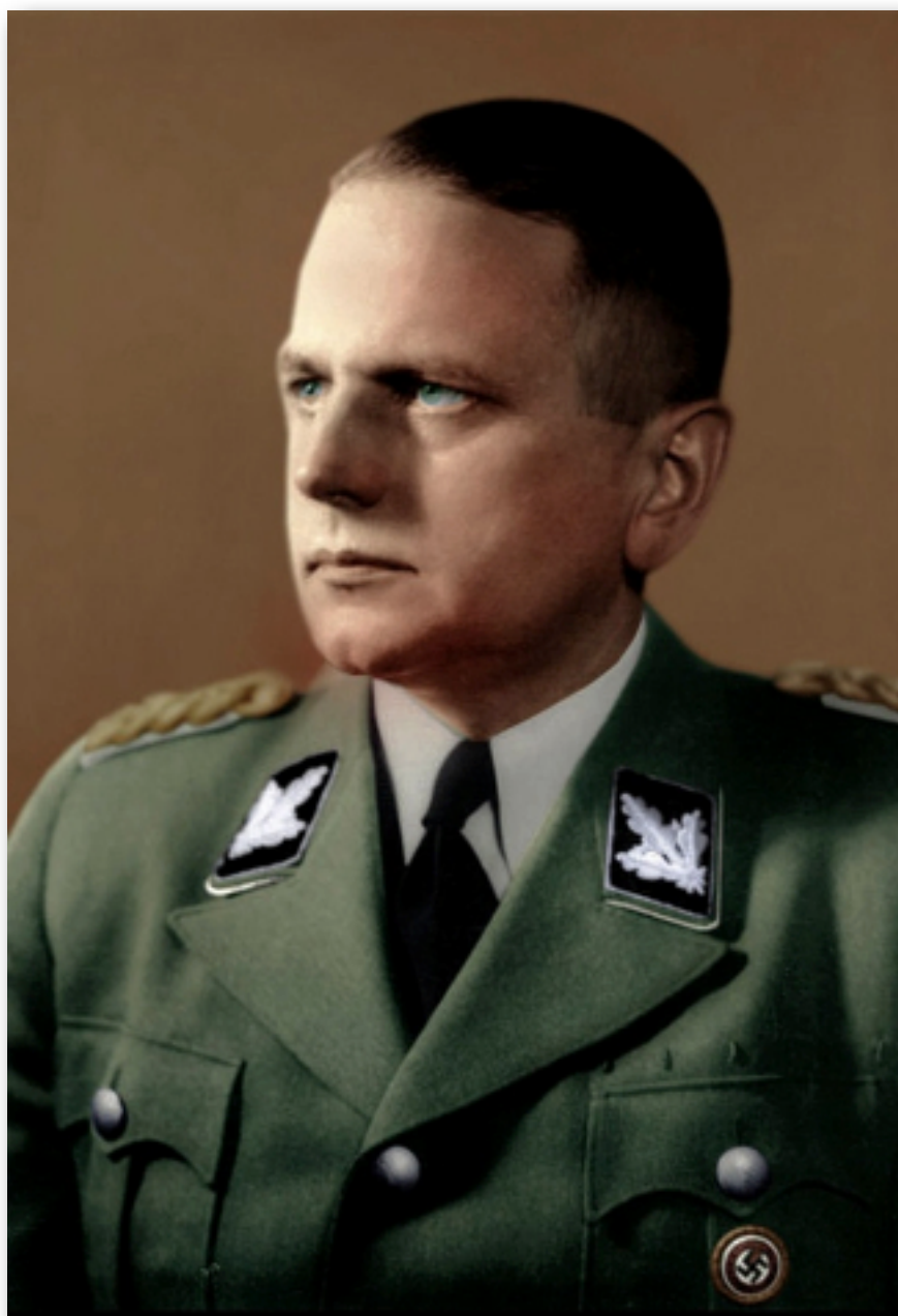
[Image] Otto Ohlendorf (4 February 1907 – 7 June 1951) was a German SS-Gruppenführer and head of the Inland-SD (responsible for

When General Taylor, the Chief Public Prosecutor at Nuremberg, was asked where he had got this figure of six million, he simply replied that the figure was based on the confession of S.S. General Ohlendorf.