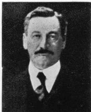
S ir Herbert Samuel, le premier haut-commissaire anglais en Palestine.