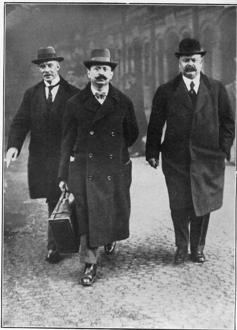
TREBICH LINCOLN (centre) in 1916.