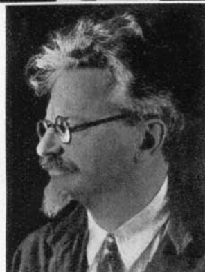
L éon Trotzky, fondateur de l'armée rouge, aujourd'hui en exil.