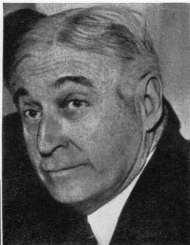
B ernard N. Baruch, banquier international et conseiller financier du président Roosevelt.