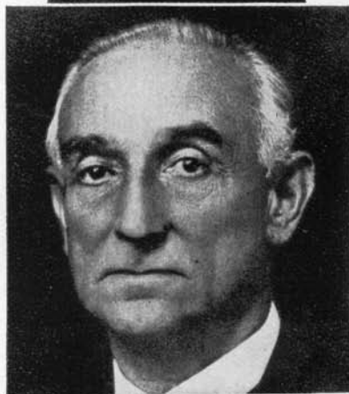
L ord Reading (sir D. Rufus Isaacs), ancien vice-roi des Indes. Il fut un des promoteurs les plus ardents de la création de la nouvelle Palestine.