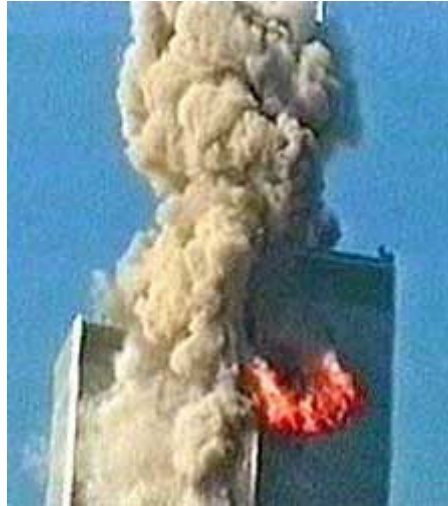
The plane hitting WTC North Tower

The first plane to hit the WTC (North Tower) hit the computer room of Marsh & McLennan, which had recently acquired Kroll Associates, which was owned by son of AIG CEO Maurice Greenberg & Jules Kroll. Precision guidance equipment in office?